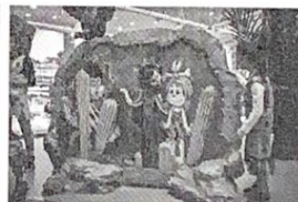
Photo corner - perete piatra

Length/Width: 200 x 200 cm. Height: 180 cm