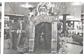
Mina de aur

Length/Width: 250 x 100 cm. Height: 200 cm (each)