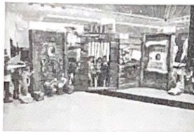
Photo corner - Wanted

Length/Width: 400 x 300 cm. Height: 220 cm Electricity connection: 220 V, 2 outlets