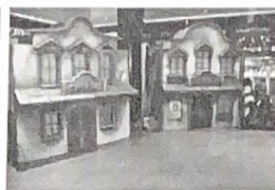
Oraselul din desert

Length/Width: 300 x 100 cm. Height: 220 cm