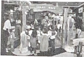
Cursa de cai

Length/Width: 500 x 300 cm. Height: 200 cm